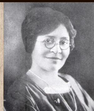
ANNIE TURNBO MALONE (1869-1957)

The first Black female millionaire in America, Madam C.J. Walker made her fortune by creating a homemade line of hair care products for Black women. Born Sarah Breedlove, she was inspired to create hair products after experiencing a scalp disorder and hair loss. It led to the creation of the Walker system of hair care. She built an empire selling products directly to Black women, then employing others to sell them. She used her fortune to fund scholarships for women at the Tuskegee Institute and donated to the NAACP, the Black YMCA, and other charities.