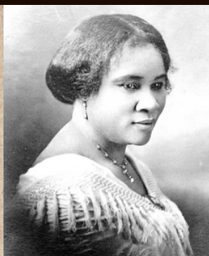
MADAM C.J. WALKER (1867-1919)